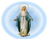
Legion of Mary