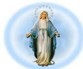
Legion of Mary