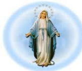
Legion of Mary