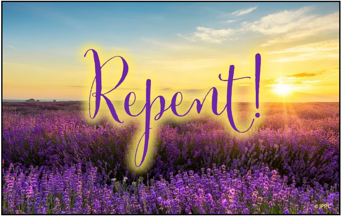
ST. FRANCIS OF ASSISI ROMAN CATHOLIC CHURCH

610-543-0848 (fax) 610-604-0283 <u>www.sfaparish.org</u> <u>contactsfaparish@sfaparish.org</u> ST. FRANCIS OF ASSISI SCHOOL 610-543-0546