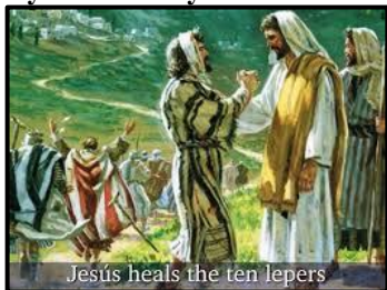
Jesus heals the ten lepers

Fourth Sunday in Ordinary Time ~January 28th, 2024