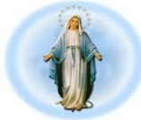
Legion of Mary