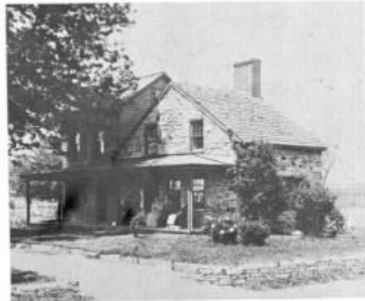
Johnston House, 1890